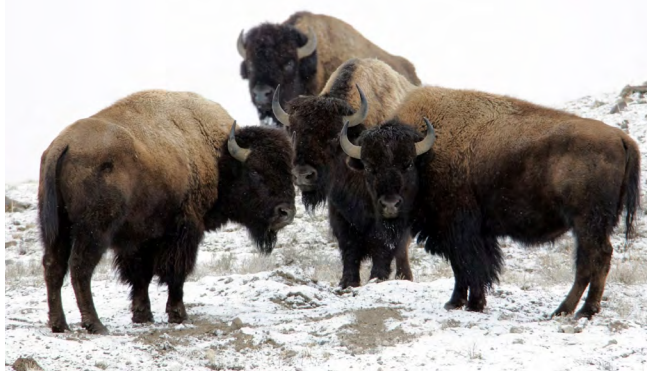
Figure 1. Bison are native to South Dakota and are extremely well adapted to our climate, topography and native forages.

North American bison ( Bison bison ) are an attractive high-value livestock species that is growing in number and popularity across the United States. While bison ranching has some similarities with cattle ranching, there are significant differences that must be accounted for to ensure long term sustainability and profitability. Bison are a hardy species that tolerate hot climates of southern Texas and cold climates of northern Canada, utilize a wide variety of native forages and forbs that may not be as palatable to cattle, and require less handling than cattle. Furthermore, bison are not domesticated and therefore are more wild, larger, and stronger than cattle — and should be managed as such.