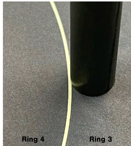
This arrow is touching the white line between the scoring rings of 3 and 4. This arrow is scored as a 4.