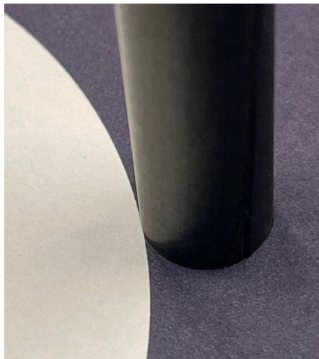
This arrow is touching the white 5 ring and is scored as a 5.