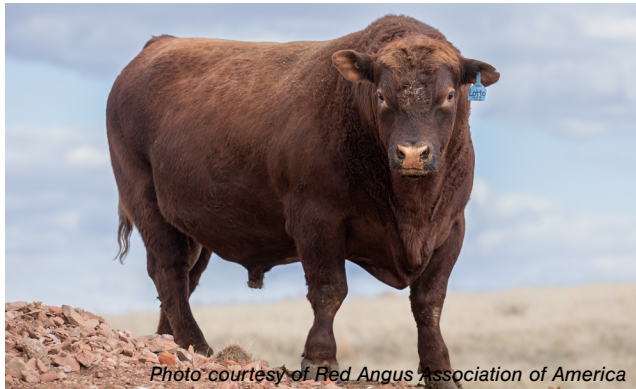
Bull: CLOVER Ang R234