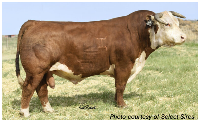
Bull: CLOVER Herf 253