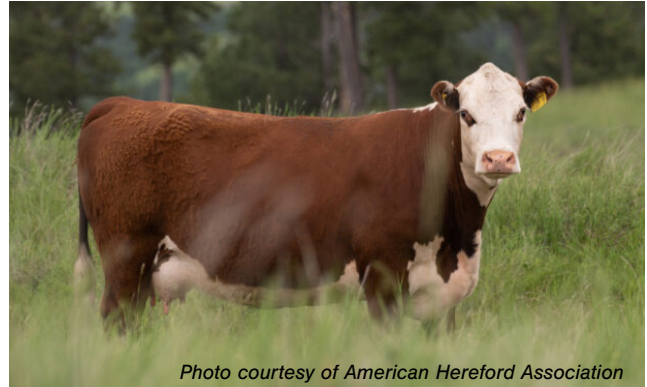
Cow: CLOVER Herf 275