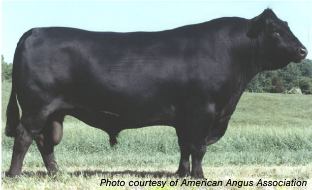
Bull: CLOVER Ang B834