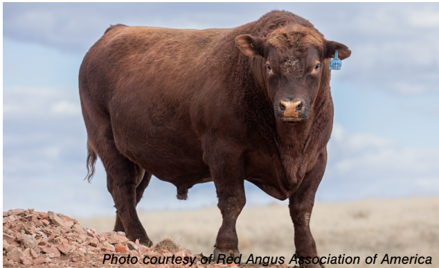
Bull: CLOVER Ang R234