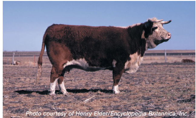
Cow: CLOVER Herf 386