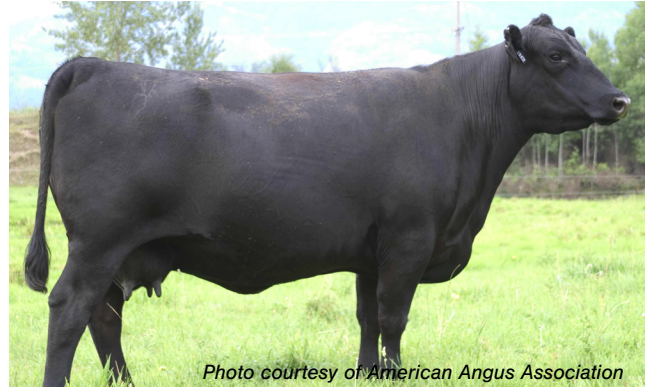
Cow: CLOVER Ang B426