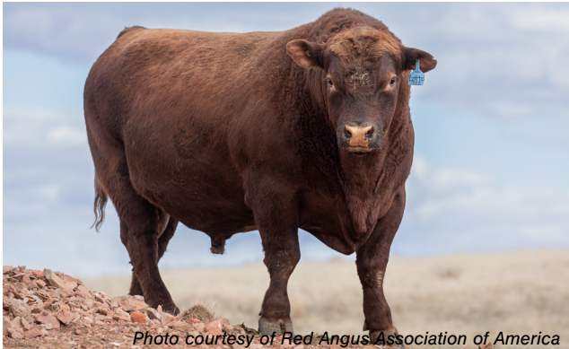
Breed: Red Angus