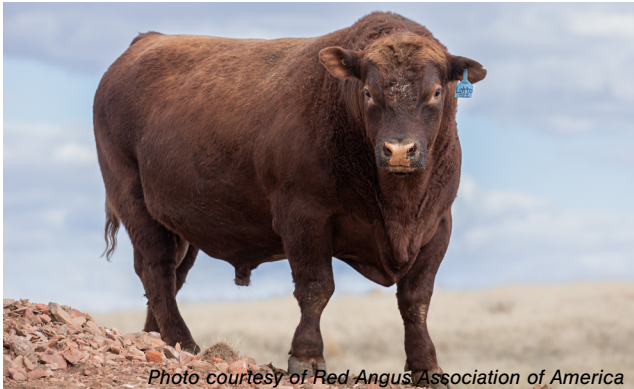
Bull: CLOVER Ang R234