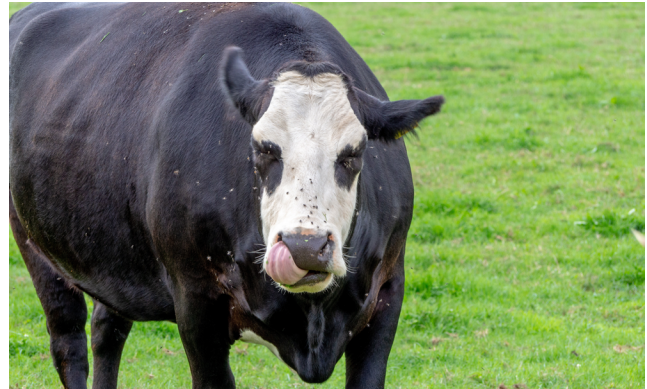
Breed: Angus Hereford Cross