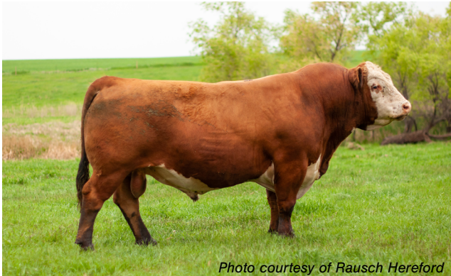
Bull: CLOVER Herf 642