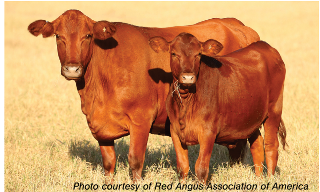
Cow: CLOVER Ang R733