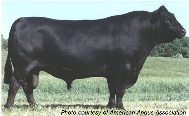
Breed: Black Angus