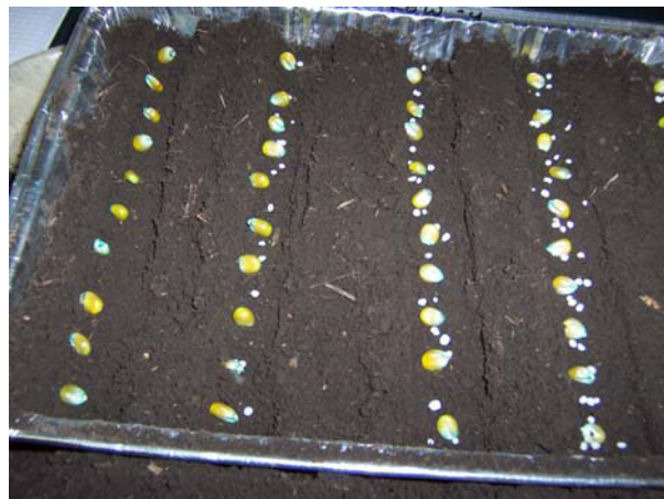
Figure 1. Pan, soil, seed, and fertilizer before covering with soil in laboratory

Nlin (SAS) procedures [both linear (L) and plateau-linear (PL)] were used to define the resulting response curves (final stand regressed on fertilizer rate (lb/a material).