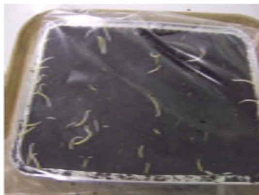
Figure 2. Emerged seedlings in laboratory emergence study.