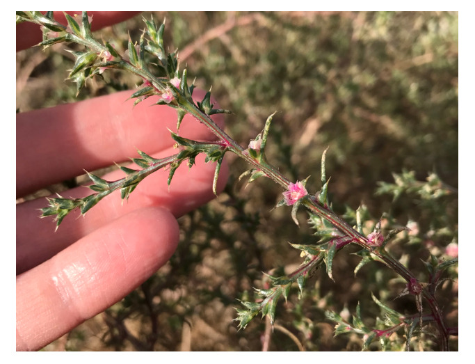
Figure 1. Prickly Russian thistle. Credit: Maribeth Latvis.

The goal of this SDSU Extension publication is to provide expanded information on the notorious invasive plant, prickly Russian thistle. It provides an overview of the classification (i.e. taxonomy) and related species of Russian thistle found in South Dakota, as well as the United States. Prickly Russian thistle, Salsola tragus , (Figure 1), is an herbaceous annual species that is one of the earliest emerging weeds in the spring. The species is now recognized as part of a broader definition of amaranth family, Amaranthaceae, where it is related to other invasive rangeland plants such as Halogeton (i.e. saltlover) and Kochia .