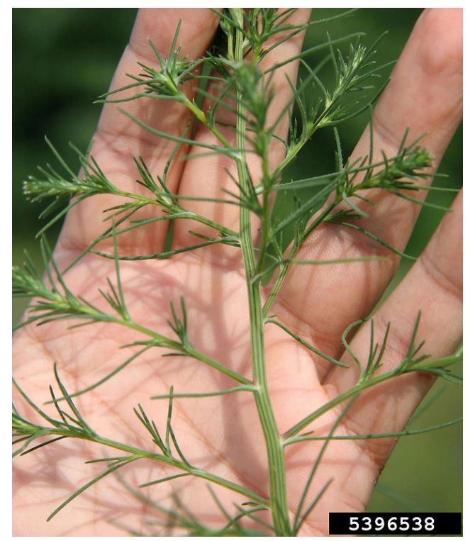
Figure 2. Slender Russian thistle (Salsola collina).

develop on prickly Russian thistle. When the plants are reproductive, slender Russian thistle will lack the membranous sepal wings that are characteristic of prickly Russian thistle. The two species both produce tumbleweeds following senescence. Slender Russian thistle is native to arid regions of Central Asia, easternmost Europe and southern Siberia. It was first reported from Dakota County, Minnesota in 1937 (Moore, 1938). Currently, it is mostly distributed across central North America and is not as widespread as prickly Russian thistle (Figure 3).