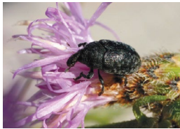
Fig. 13 Larinus minutus adult (flower-head weevil) and emergence hole in a knapweed seed head.