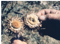
Fig. 10 Left: Normal musk thistle seed head. Right: infested seed head.