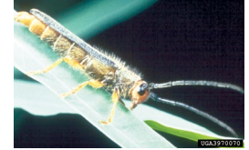
Fig. 5 Oberea erythrocephala on leafy spurge