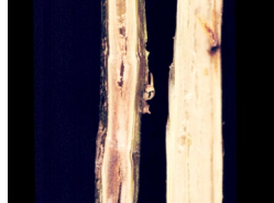
Fig. 8 Urophora cardui (Canada thistle gall fly and gall on Canada thistle stem)