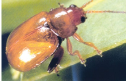
Fig. 1 Aphthona nigriscutis adult (brown flea beetle)