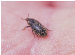
Fig. 9 Rhinocyllus Conicus adult (musk thistle seed weevil)