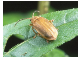
Fig. 14 Galerucella sp. defoliating beetle and rearing buckets and tents