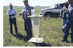
Fig. 4 SD flea beetle collection/beetle trap