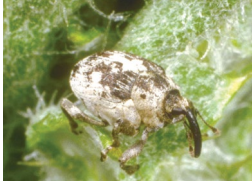
Fig. 6 Hadroplatus litura (Canada thistle stem mining weevil)