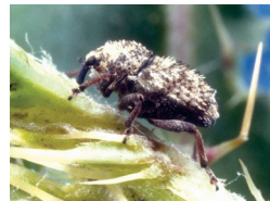
Fig. 11 Trichosivocalus horridus adult (musk thistle Rosette weevil)