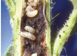
Fig. 7 Hadroplatus litura larvae and damage to Canada thistle stems