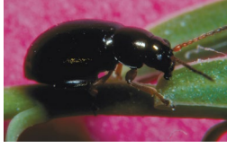
Fig. 2 Aphthona lacertosa (black flea beetle)