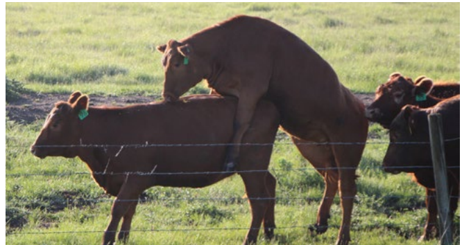
Figure 1: Standing to be mounted by a bull or another cow is the only conclusive sign that a cow is in standing estrus and ready to be bred.

mount other animals. Only the cow/heifer that stands to be mounted is actually in standing estrus (Figure 1). The cow that is doing the riding may or may not be in standing estrus. A cow/heifer that mounts another animal a few times and then leaves the sexually active group is likely not in standing estrus, but an animal that consistently mounts other animals may be and thus requires further observation.