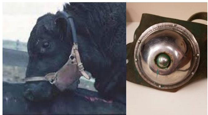
Figure 3. A chin-ball marker, which works like a ball point pen, is worn under the chin of a marker animal and marks the animals that are mounted.

Marker animals are usually equipped with some form of a marking device. The most common is the chin-ball marker (Figure 3). This device is worn on a halter under the marker animal's chin and works much like a ball-point pen. When an animal in standing estrus is mounted by the marker animal, the chin-ball marker will rub against the animal in standing estrus, leaving marks on her back and rump. You must learn to interpret these marks, since marks can also be left when the marker animal rubs its chin on animals.