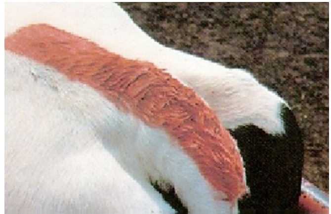
Figure 5. Chalk is placed on the animal's tailhead from hooks to pins. The chalk is rubbed off when an animal stands to be mounted.