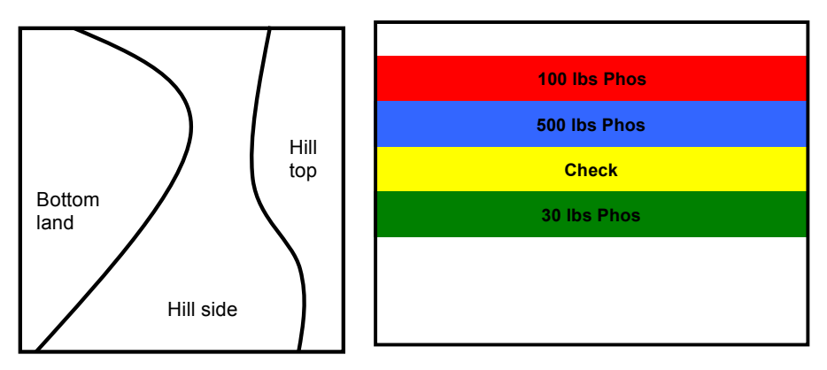
Figure 32.2. Field treatment for the four P rates.