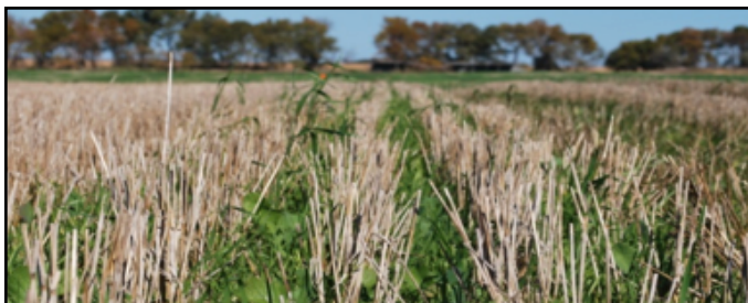
Figure 7.1. Cover crop planted into wheat stubble.