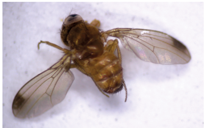
Figure 5. Spotted Wing Drosophila male