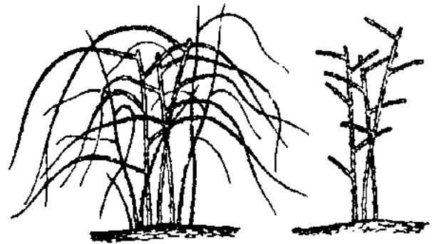
Figure 3. Purple raspberries before and after dormant pruning.

Trellising is recommended for raspberries to prevent wind injury. Trellising improves yield and light penetration, and makes picking easier. The primocane/fall fruiting types fruit at the cane tops, and the heavy fruit load causes the cane to droop toward the ground. Purple raspberries do not require trellising.