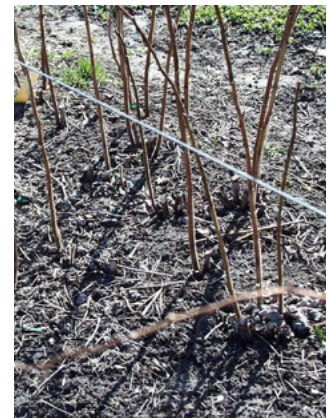
Figure 1 & 2. Summer-fruiting raspberries after dormant-season pruning. Summer-fruiting raspberry canes should be thinned to 6 to 8 canes per foot of row.