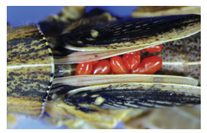
Figure 2. Eutrobidium spp. larvae attached to grasshopper wing veins.