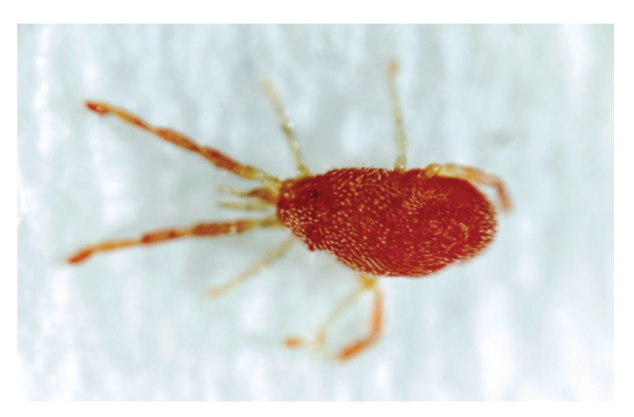
Figure 1. Grasshopper mite deutonymph or adult.

Only the larvae of grasshopper mites are observed on grasshoppers. Newly hatched larvae range in color from yellow to orange or scarlet and have eyes