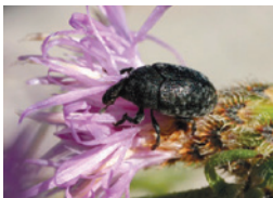
Fig. 13 Larinus minutus adult (flower-head weevil) and emergence hole in a knapweed seed head.