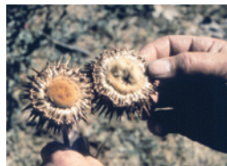
Fig. 10 Left: Normal musk thistle seed head. Right: infested seed head.