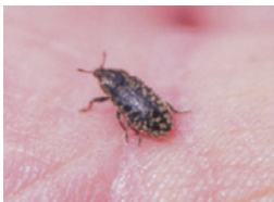
Fig. 9 Rhinocyllus Conicus adult (musk thistle seed weevil)