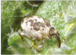
Fig. 6 Hadroplactus litura (Canada thistle stem mining weevil)