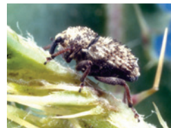
Fig. 11 Trichosivocalus horridus adult (musk thistle Rosette weevil)