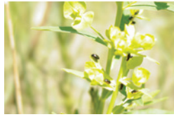
Fig. 3 Aphthona lacertosa beetles on leafy spurge