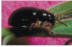
Fig. 2 Aphthona lacertosa (black flea beetle)