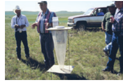
Fig. 4 SD flea beetle collection/beetle trap