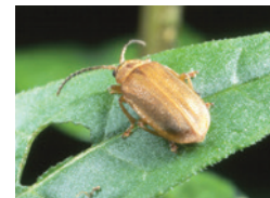
Fig. 14 Galerucella sp. defoliating beetle and rearing buckets and tents