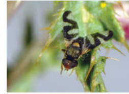
Fig. 8 Urophora cardui (Canada thistle gall fly and gall on Canada thistle stem)