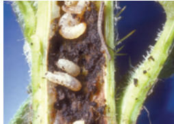
Fig. 7 Hadroplactus litura larvae and damage to Canada thistle stems