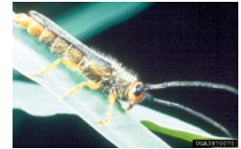
Fig. 5 Oberea erythrocephala on leafy spurge