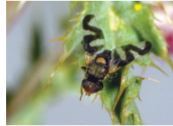
Fig. 8 Urophora cardui (Canada thistle gall fly and gall on Canada thistle stem)