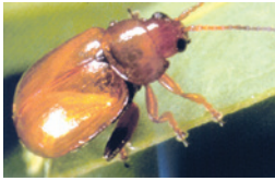
Fig. 1 Aphthona nigriscutis adult (brown flea beetle)