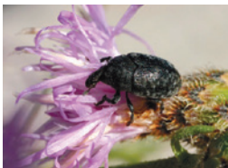
Fig. 13 Larinus minutus adult (flower-head weevil) and emergence hole in a knapweed seed head.