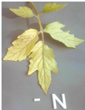
Nitrogen-deficient tomato leaf

Most people would agree that eating vegetables is good for your health, but sometimes we forget what is good for a vegetable's health. Home-grown vegetables and fruits, are nutritious, but they also need optimal nutrients to produce a peak yield of high quality produce. This fertilizer guide will help you to give your garden vegetables, fruits and flowers the correct nutrition so that they can produce to their best potential. Compare the photos of a malnourished tomato leaf with the healthy, dark-green tomato leaf. The malnourished tomato is lacking in nitrogen, the nutrient required in the most abundance. Not only does the nitrogen-deficient tomato look "sick," but it will also not be able to produce as much high-quality fruit.