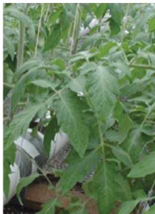
Healthy tomato leaf

Nitrogen-deficient tomato, Photo credit: Epstein and Bloom 2004, Bugwood.org and Healthy tomato leaf, Photo credit: David Graper